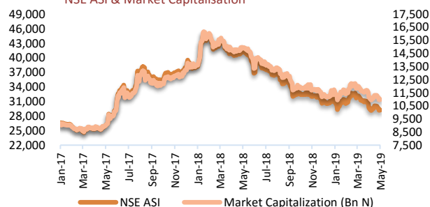
NSE ASI & Market Capitalisation

The Nigerian equities market closed on a negative note, by 59bps, even as the Exchange recorded 23 losers and 13 gainers. Hence, the year to date loss of the NSE ASI further worsened to 1.15% from 0.56% as NASCON, UBA and OANDO contracted by 4.41%, 5.30% and 9.68% respectively, pulling the NSE Consumer goods, NSE Banking and NSE Oil and gas indexes southwards by 1.05%, 1.73% and 1.06% accordingly. The total value of equities traded fell by 53.66% to N5.892 billion as did the total volume which dwindled by 43.49% to 376.80 million units. Meanwhile, NIBOR fell by most maturities tracked amid liquidity ease; while NITTY moved in mixed directions. In the bonds market, the values of OTC FGN bonds fell across board amid sell pressure; on the other hand, FGN Eurobond prices rose for most maturities tracked in the international capital market amid bargain hunting.