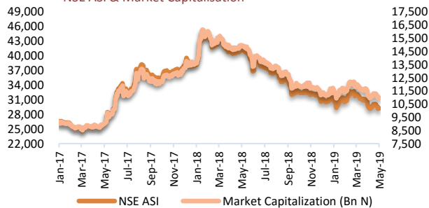
NSE ASI & Market Capitalisation

The Local bourse slid further into the negative territory by 221bps amid sustained sell-offs, even as the Exchange recorded 20 losers as against 14 losers at the close of business today. Consequently, the year to date loss of local stocks further worsened to 3.92% from 1.75%. Share prices of bellwethers such as MTNN and DANGCEM dipped by 7.14% and 4.00% respectively even as OANDO and FO (Forte Oil) waned by 2.27% and 1.26% respectively. Of the sector gauges, the Industrial and Oil & Gas indices were most hit as they contracted by 2.09% and 0.39% respectively. Meanwhile, the total value of equities traded nosedived by 66.54% to N2.21 billion while total volume of transactions shrank by 49.60% to 148.21 million units. Elsewhere, NIBOR rose for most tenure bucket tracked on sustained liquidity squeeze; however, NITTY fell for most maturities tracked on bullish activity. The values of OTC FGN bonds were flattish across board; on the flip side, the FGN Eurobond prices rose for most maturities tracked on renewed demand pressure.