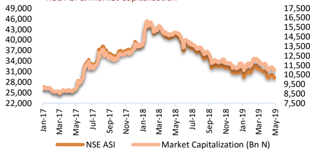
NSE ASI & Market Capitalisation

The Local bourse rallied by 2.87% amid sustained bargain hunting activities, despite printing 20 losers as against 16 gainers at the close of business today. Also, symbols such as GUARANTY, FO and DANGCEM rose by 2.96%, 8.81% and 3.93% respectively, lifting the NSE Banking, NSE Oil & Gas and NSE Industrial gauges by 0.94%, 0.53% and 2.08% respectively. Hence, the year to date losses of local stocks contracted further to 3.86% from 6.54%. Similarly, the total value of equities traded surged by 116.66% to N17.19 billion; as did the total volume of equities traded which ballooned by 56.51% to 335.60 million units. Meanwhile, NIBOR fell for most maturities tracked on sustained liquidity ease; however, NITTY rose for most tenure bucket amid renewed sell pressure. In the bonds market, the value of OTC FGN long term debts moved in mixed directions while the FGN Eurobond prices rose for most across board on sustained buy pressure.