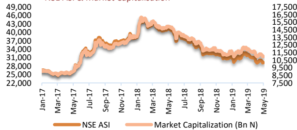
NSE ASI & Market Capitalisation

The local bourse dwindled by 1.26% amid sustained profit taking activities as the bears outshined the bulls (30 losers against 11 gainers) at the close of business today. Symbols such as GUARANTY, CADBURY and MOBIL waned by 3.13%, 4.55% and 4.62% respectively, dragging the NSE Banking, NSE Consumer Goods and NSE Oil & Gas sectorial indices down by 2.80%, 1.57% and 1.05% respectively. On a year to date basis, losses of local stocks rose to 9.37% from 8.22%. Similarly, the total volume of equities traded dipped by 8.73% to 214.68 million units; however, we saw the total value of equities traded surge by 104.71% to N2.78 billion. Elsewhere, NIBOR moved in mixed directions across maturities tracked; as did NITTY for maturities tracked. In the bond market, the value of OTC FGN long term papers was flattish for most maturities tracked; however, the FGN Eurobonds prices fell across board amid bearish activity.